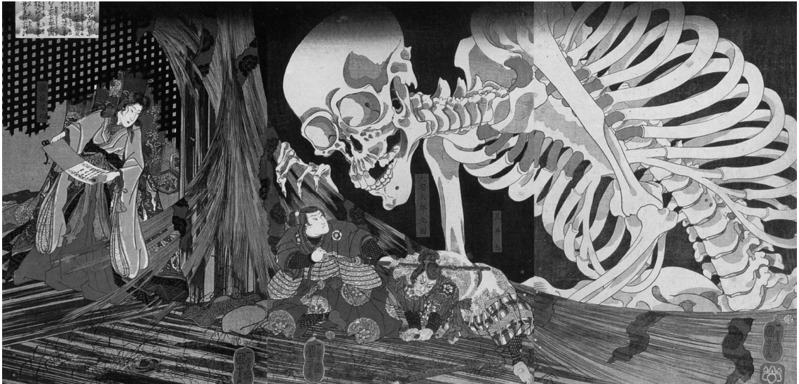
Takiyasha the Witch and the Skeleton Specter

no background here, but note how the deeper blue at the top gives one an impression of distance stretching away behind, of a horizon that separates the figures into a default foreground with those at the bottom of the piece nearest to the viewer. The incredible balance here is achieved by the spacing between the octopi, where what is really just emptiness takes on an important role in unifying one's experience of the varied and fanciful scene.